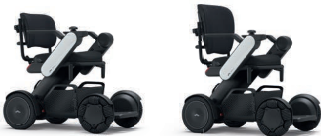
Adjustable tubular back support (Model C2 Back Support Mounting System - see page 19)